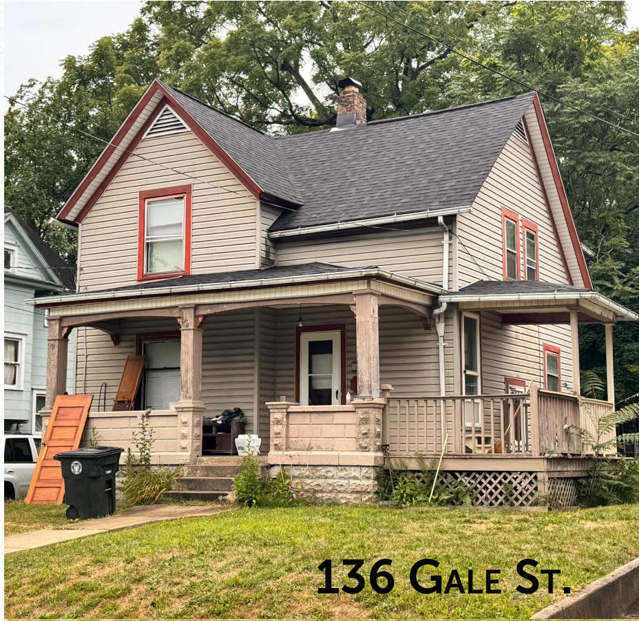
136 GALE ST.