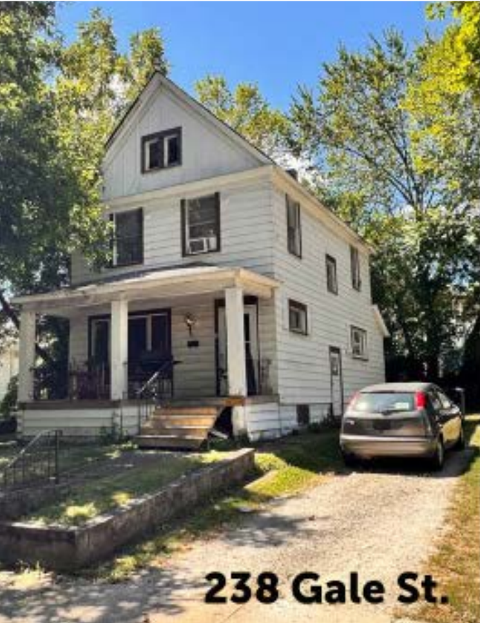
238 Gale St.